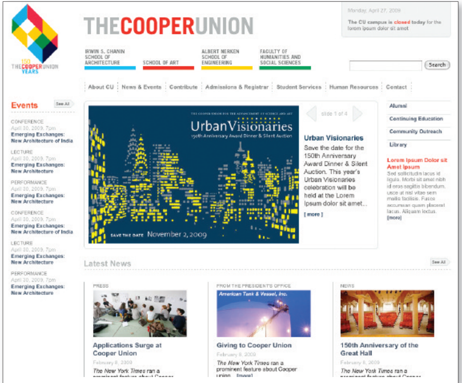
Early design mock-up for new Cooper Union website

Even in our first phase, the new site allows multiple users from within the institution to submit and edit content simultaneously, with varying publishing privileges. These college-wide contributions will ultimately help the web site reach its full potential later next year, when we roll out phase two and include redesigned sections for the four academic divisions: art, architecture, engineering and humanities. For phase one, these sections of the site will remain as-is within the new site's redesigned framework. I have worked professionally with The Cooper Union in the past, but this new web site is by far my largest project with the college. It has been fantastic to work with the administration and the Center for Design and Typography. My design team and I enthusiastically await the next stage in the project and the subsequent feedback!